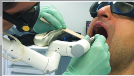
Step 2: TISSUE STRENGTHENING