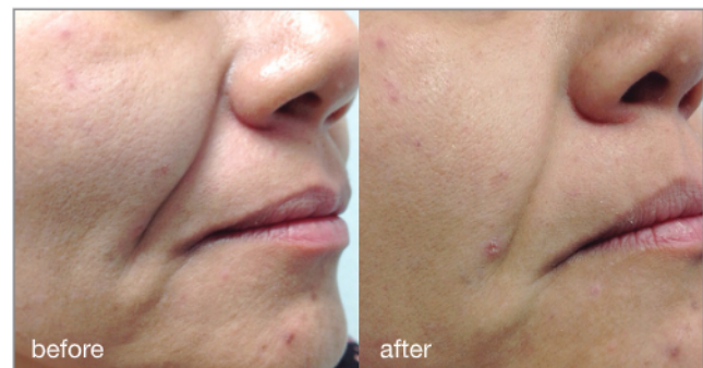
Fotona4D® procedure: courtesy of Adrian Gaspar, MD

A light cold Er:YAG ablation that gives a pearl finish to the skin. SupErficial™ additionally improves the appearance of the skin and reduces imperfections by using propriety VSP technology, enabling the operator to easily adjust the laser to an extremely controlled light peel, without thermal effects, for a no-down time, precise treatment.